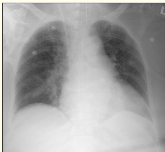
Figure 4: Chest X-ray post-recruitment.

With adequate PEEP upon ventilatory support and clinical manoeuvres by positioning patient to right lateral decubitus with the affected left side facing up, REPE as well as the collapse and consolidation of the left lower lobe were resolved.