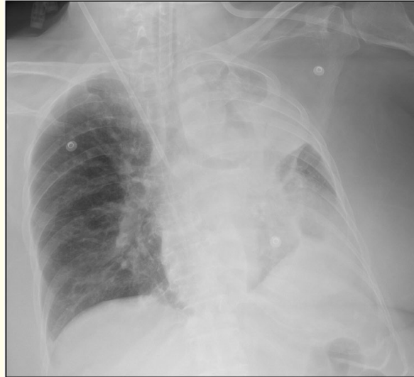
Figure 3: Chest X-ray post-bronchoscope.