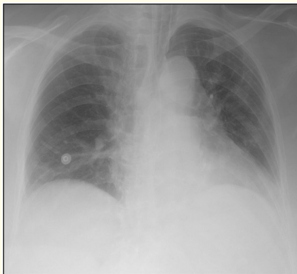
Figure 1: Chest X-ray upon initial encounter at emergency.

She was treated for septic shock caused by community-acquired pneumonia and bullous cellulitis in the left lower leg, with concomitant acute submassive pulmonary embolism and right lower limb deep vein thrombosis. Antibiotics and anticoagulants were started as part of the initial treatment. Later, the patient required bronchoscopy due to prominent features of collapse and consolidation over the left lower lobe in keeping with the absence of left-sided diaphragmatic outlines based on repeated chest X-rays. Bronchoscopy was done and noted thick mucous secretions over the left upper and lower lobes, which were sucked out. Post-procedure, the patient desaturate down to 90% and required a greater PEEP to maintain her saturation. Repeated chest X-rays suggest unilateral left upper lobe lung collapse and lower lobe REPE. The figure below illustrates the chest X-rays associated with this case, beginning with the initial encounter, pre-bronchoscope, immediate post-bronchoscope, and later post lung recruitment.