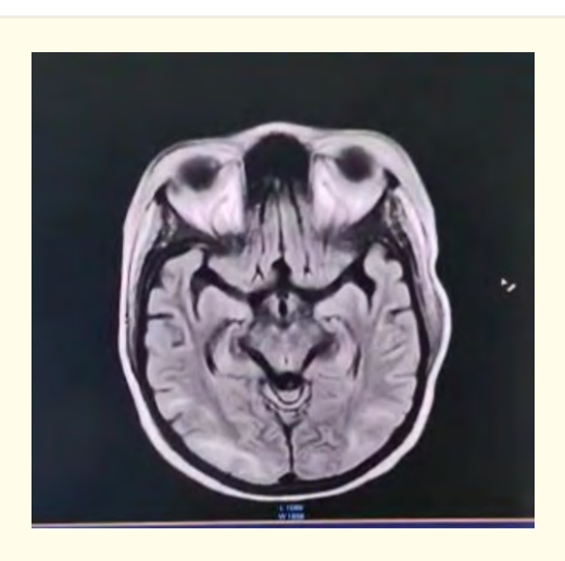
(iii) Altered signal lesions distributed in supratentorial compartment and bilateral parieto-occipital regions.

During the admission in SVBP Hospital, patient's consciousness improved after infusion of 2 units of PRBCs. Patient was administered IV antibiotics and antiepileptics and supportive treatment during hospital stay. Gradually the patient gained complete consciousness and was fully oriented to time, place and person at the time of discharge.