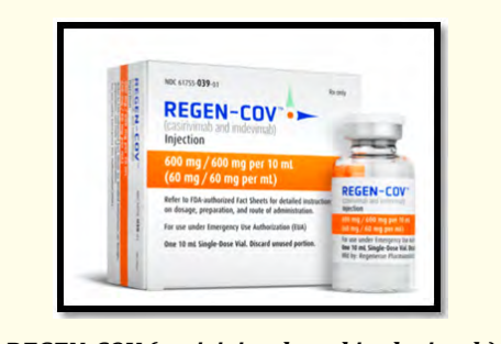
REGEN-COV (casirivimab and imdevimab)

Effectiveness: New data has suggested that REGEN-COV is highly unlikely to be effective against the Omicron variant, which is the predominant variant in the U.S.