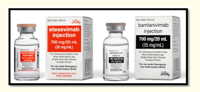
Bamlanivimab and etesevimab

Effectiveness: New data has indicated that bamlanivimab and etesevimab are highly unlikely to be effective against the Omicron variant, which is the potent variant in the U.S.