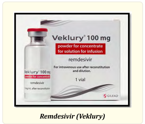
Remdesivir is now the first COVID-19 treatment fully approved for kids younger than 12 years old (April 25, 2022) [9]

Other considerations: In an outpatient setting, remdesivir requires travel to and from an infusion location. And it's recommended to get an infusion on 3 back-to-back days.