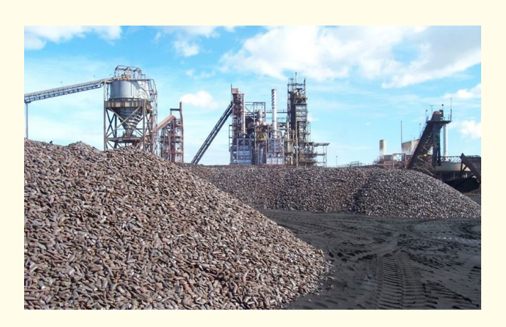
Figure 3: HBI stockpile at the Trinidad plant.

Since the design, erection and operation of the first Circored plant in Trinidad, numerous modifications compared to the original setup were investigated and developed, as